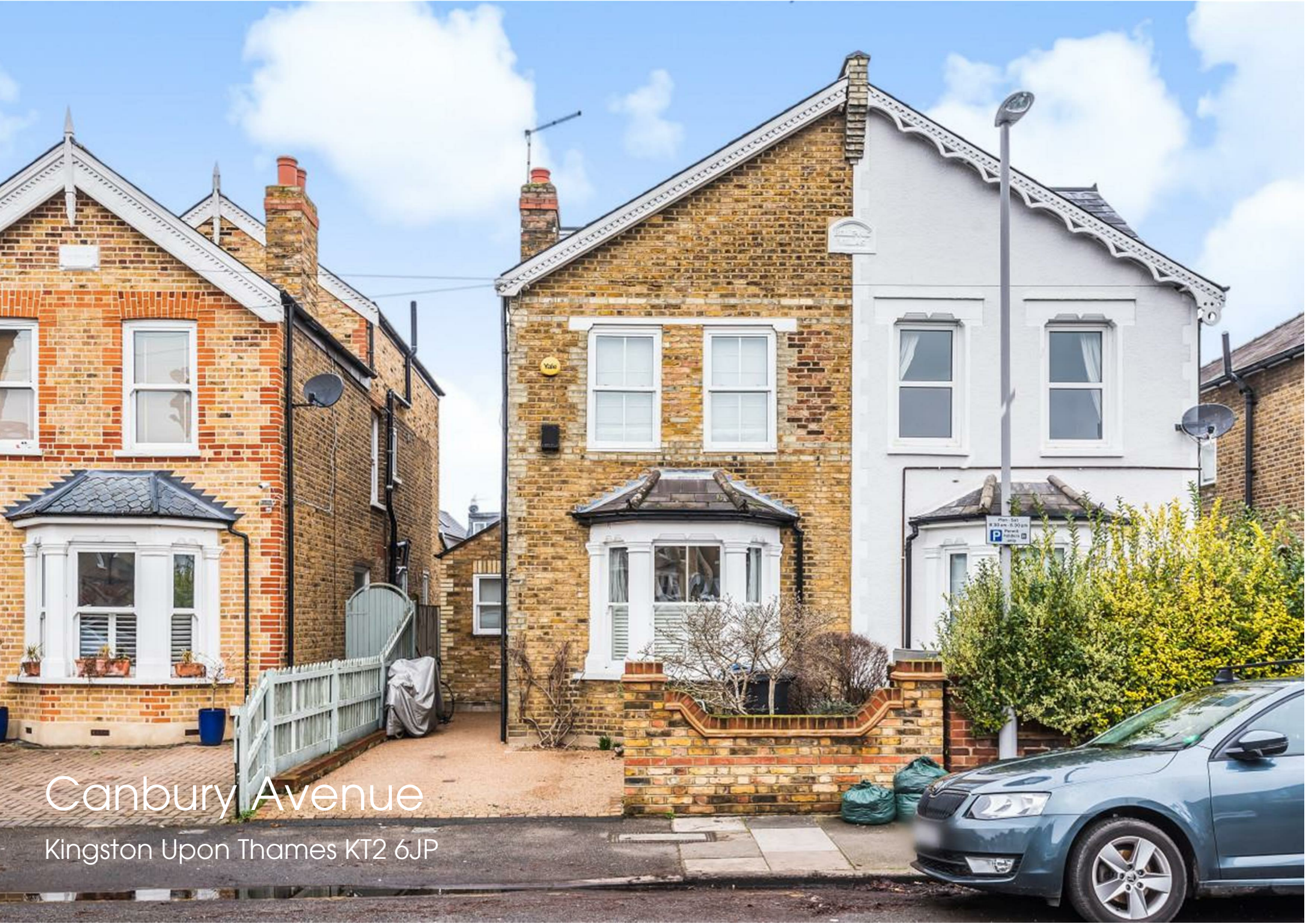
Canbury Avenue Kingston Upon Thames KT2 6JP

34 Richmond Road Kingston upon Thames Surrey KT2 5ED www.gibsonlane.co.uk Tel: 020 8546 5444